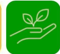
Support the Environment