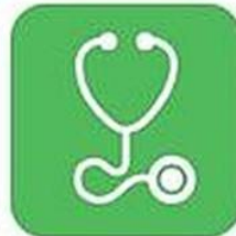
Disease Prevention & Treatment