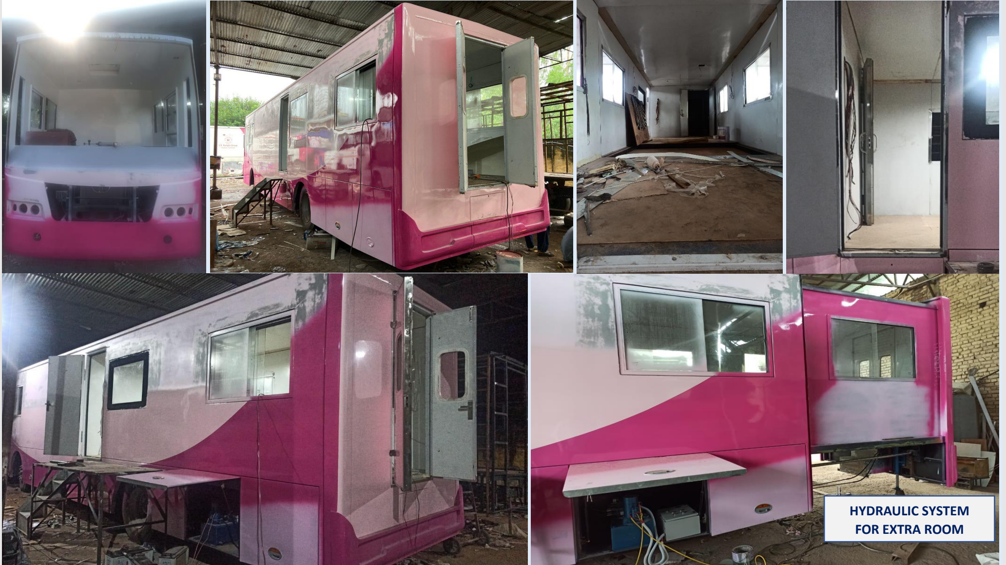
HYDRAULIC SYSTEM FOR EXTRA ROOM

WE ARE THANKFUL TO EVERYONE WHO HAS HELPED US AND SUPPORTED THIS PROJECT AND HAVE MADE IT POSSIBLE