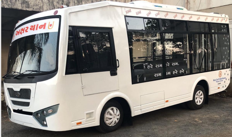
(1) AKSHARYAAN SERVICE-JOURNEY TO THE LAST DESTINATION