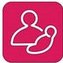
Maternal & Child Health