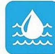
Water, Sanitation & Hygiene