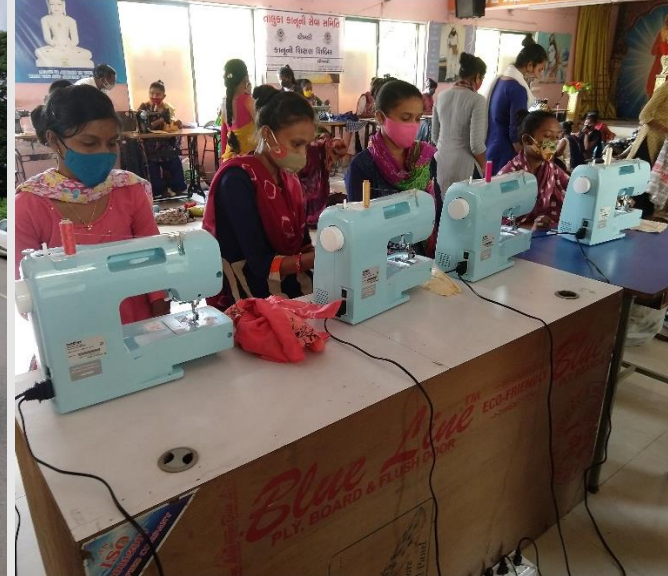
(4) WOMEN EMPOWERMENT CENTRE, GOLWAD CHIKHLI-TAILORING INSTITUTE