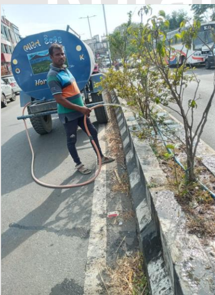
(3) SUPPORTING ENVIRONMENT-MAINTAINING PLANTS & TREES