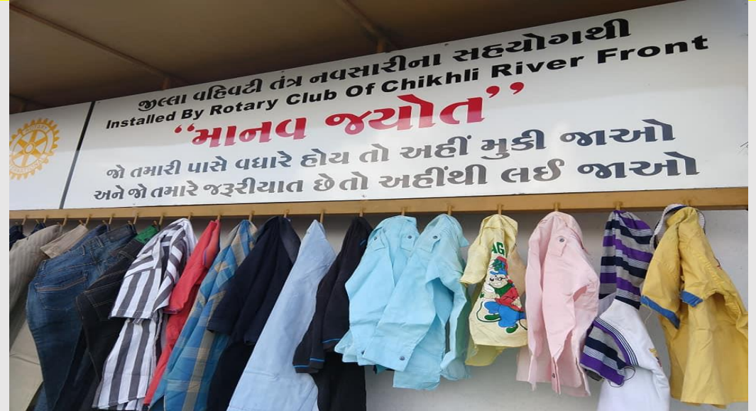
(2) MANAV JYOT – WALL OF HUMANITY-NEKI KI DEWAAR