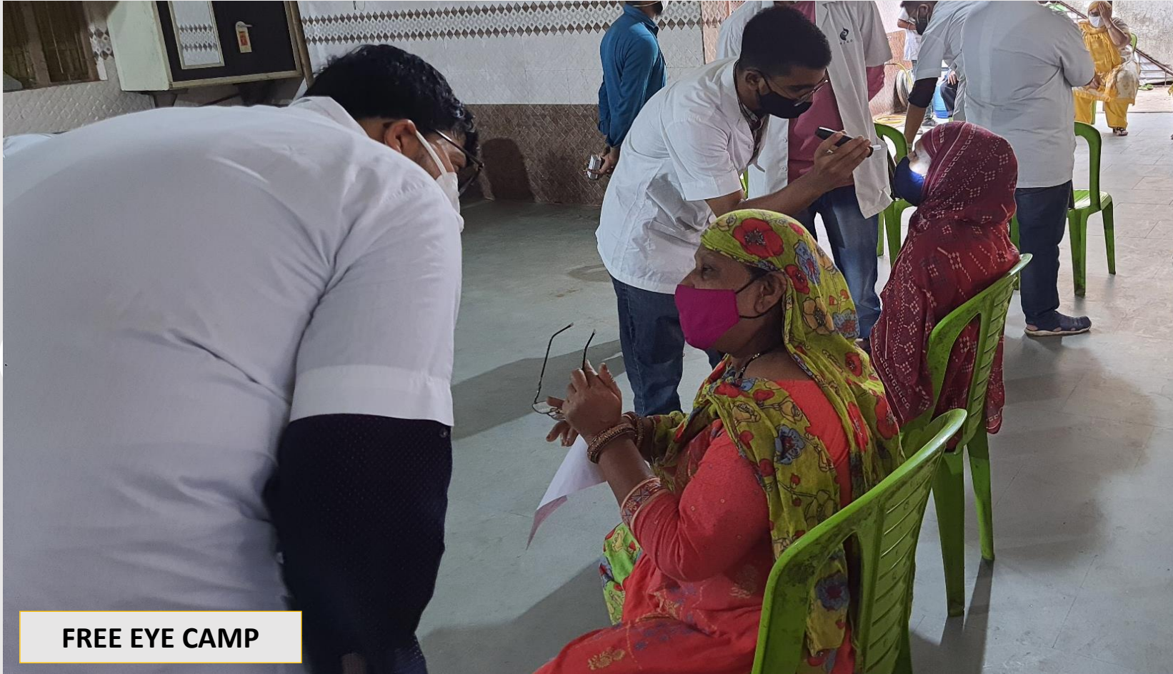
FREE EYE CAMP

CHARTER DATE 7 JULY 2018 CLUB No.: 89348 ROTARY DISTRICT 3060