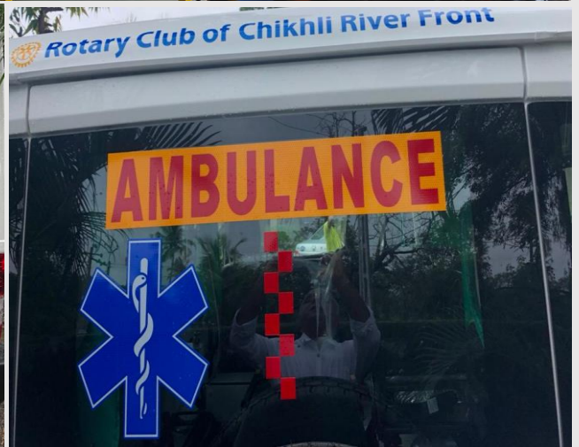
(5) AMBULANCE SERVICE WAS INAUGURATED AND IS SERVING FREE TRANSFER OF PATIENTS FROM ONE HOSPITAL TO OTHER WITHIN 30 KMS OF RADIUS