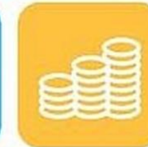
Community & Economic Development