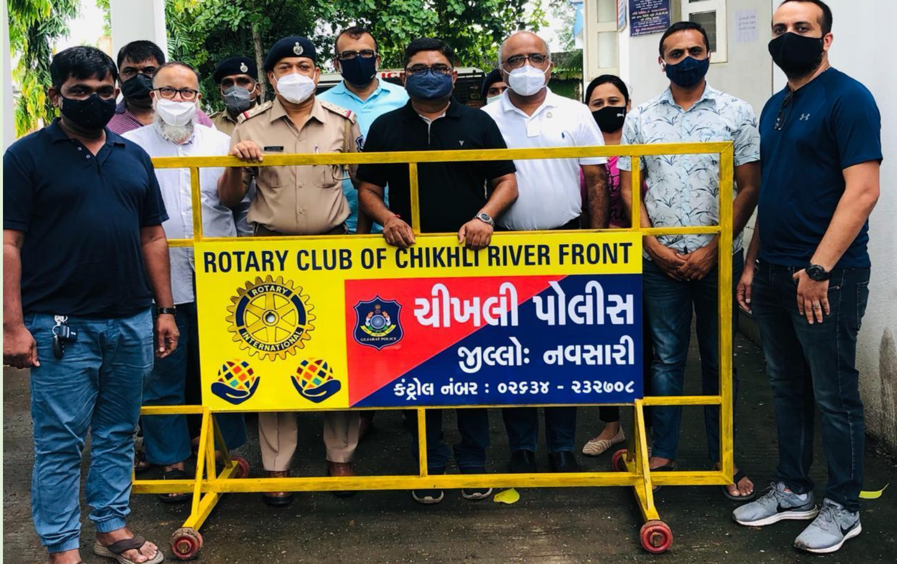
PROVIDING 10 BARRICADES TO CHIKHLI POLICE DISTRICT NAVSARI FOR SERVING THE PUBLIC