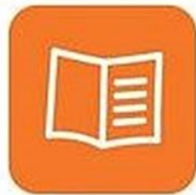
Basic Education & Literacy